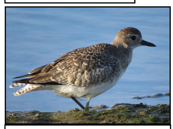
Bird Watching group - Grey Plover.