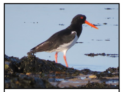
Bird Watching group - Oyster Catcher