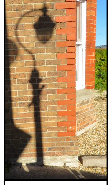
Digital Photo group - Shadows theme. Photo: Les Mould

Group Leaders' Lunch in October (see page 30) Photo: Les Mould