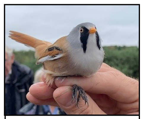
Bird Watching group - Male Bearded Tit