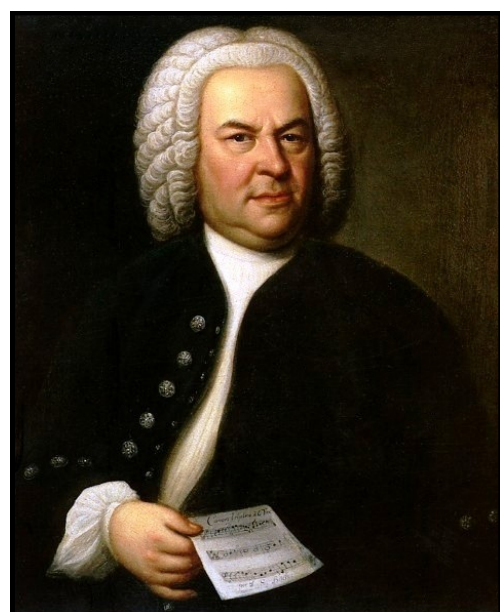
Johann Sebastian Bach