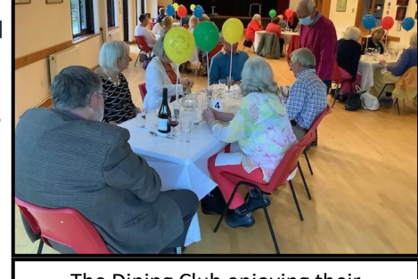
The Dining Club enjoying their Mediterranean meal.

Members' compliments for all my efforts arranging this meal in-line with current Covid guidelines were hugely appreciated. All of us enjoyed ourselves - very much socialising again in a safe venue with our own personal Chef. A great success.