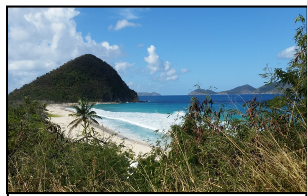
Beach on Tortola, British Virgin Islands