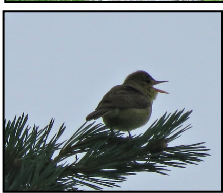
A Melodius Warbler at Middlebere (Bird Watching)