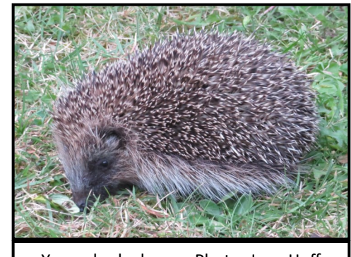
Young hedgehog P