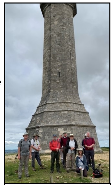
At the Hardy Monument